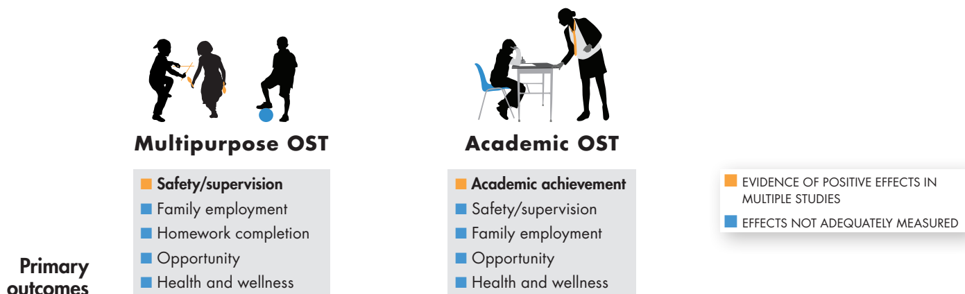
FIGURE 2 Many primary outcomes of OST programs are not adequately measured.

Findings from randomized studies of 21st CCLC programs and other multipurpose programs indicate that youth assigned to participate in the programs were more likely to be supervised by adults, and elementary school participants reported feeling safer compared with youth not assigned to these programs. 19 Increased adult supervision meant that students were less likely to be cared for by older siblings and had less time for unsupervised activities with peers out of school. 20 Adult supervision is important to youth development and promotes personal safety and not participating in risky behaviors, such as smoking.